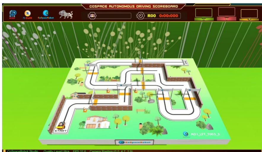
Figure 7: VIRTUAL_WORLD Layout