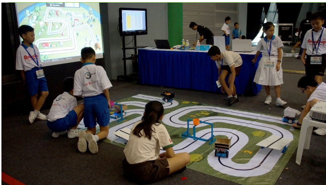
Figure 1: CoSpace Auto-driving Challenge

In the CoSpace Autonomous Driving FirstSteps, U12 category, students will only compete in VIRTUAL_WORLD .